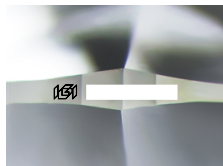
Sample Image Used